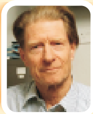
Prof. Sir John Gurdon , Kt DPhil DSc FRS Distinguished Group Leader, The Wellcome Trust/Cancer Research UK; The Gurdon Institute, University of Cambridge, UK Tennis Court Road, Cambridge CB21QN, UK Email: j.gurdon@gurdon.cam.ac.uk

Sessions: Distinguished Lecture Awards Function